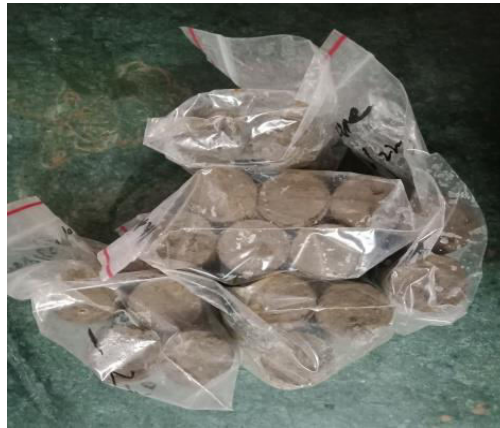
Fig. 4 Curing of nano silica treated bentonite samples

cylindrical moulds (38 mm diameter, 76 mm height). Specimens were then extracted hydraulically and cured at 25\pm 2^{\circ}\text{C} in airtight plastic bags (Fig. 4) for 7, 14, and 28 days.