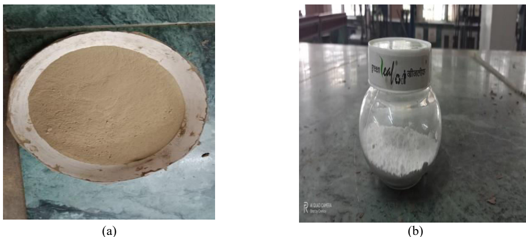
Fig. 1 a) Bentonite b) nano silica

Nano silica was sourced from Ad Nano Technologies, Karnataka, India, and bentonite from Sachdeva Traders, Jalandhar, India (Fig. 1a, 1b). The chemical compositions, as provided by the manufacturers, indicated high silicon dioxide content in both materials. Physical properties of nano silica are presented in Table 2. Specific gravities of bentonite and nano silica were determined as 2.25 and 1.67 respectively using the density bottle method (IS-2720-Part-III, 1980). Bentonite's maximum dry unit weight and optimum moisture content were found to be 11.57 kN/m 3 and 45.87%.